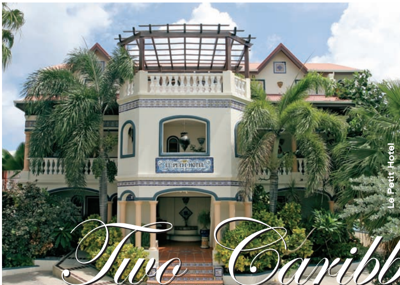
Le Petit Hotel