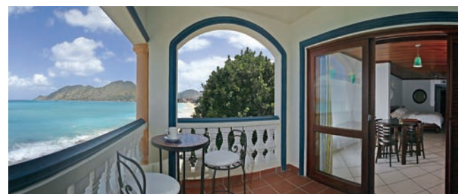
Balcony - Le Petit Hotel